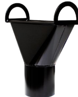
Transition Suction Cone

Ideal for low water pumping or tank draining.