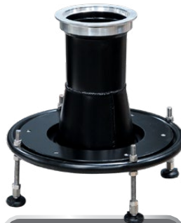
Tank Bottom Suction Cone

Ideal for low water pumping or tank draining.