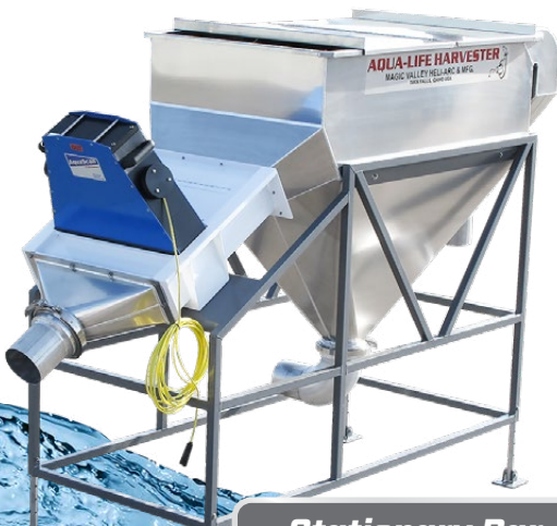
Stationary Bar Grader & Counter

Increases fish safety, Decrease setup times, Allows for low water pumping