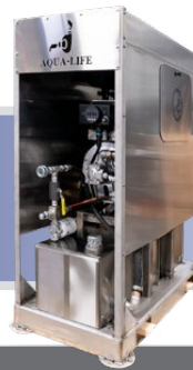
Diesel Power Unit