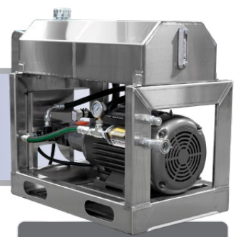
Electric Power Unit