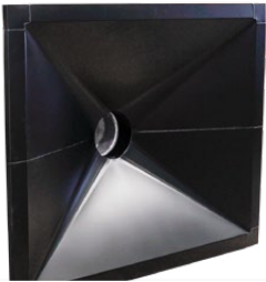
Standard Intake Chute