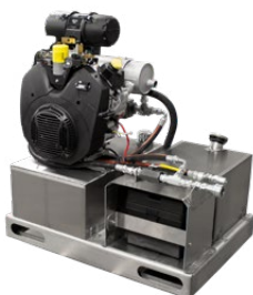
Gas Power Unit