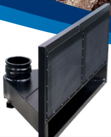
Inverted Intake Chute