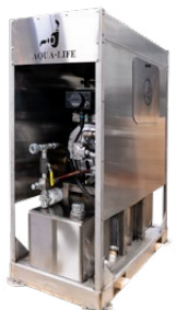
Diesel Power Unit