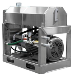
Electric Power Unit